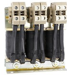
Three phase motor choke VLXM300 300A 0.04mH, suitable for drives size 90...110kW