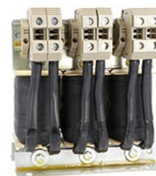
Three phase motor choke VLXM050 50A 0.2mH, suitable for drives size 15...22kW