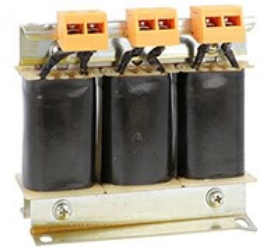
Three phase motor choke VLXM012 12.5A 1mH, suitable for drives size 0.2...0.4kW

Product designation Product type designation Version