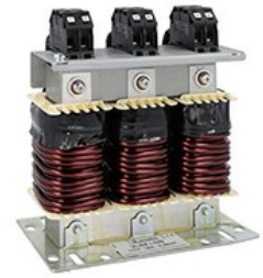
Mains choke for VLB3 variable speed drives VLBXL300 100A, 0.30mH, for VLB3 size 55kW