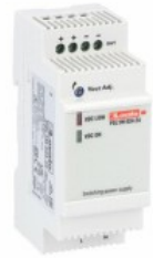
Modular switching power supplies PSL1M