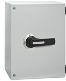
Enclosed changeover switch GLZM