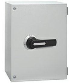
Enclosed changeover switch GLZM