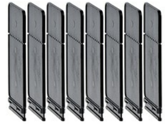
Phase barrier GLX9

Product designation Product type designation