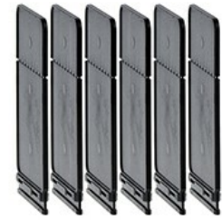
Phase barrier GLX9

Product designation Product type designation