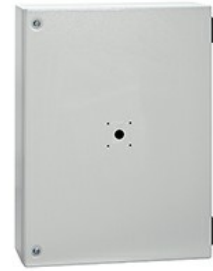
Empty metal enclosures GAZM