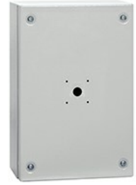
Empty metal enclosures GAZM