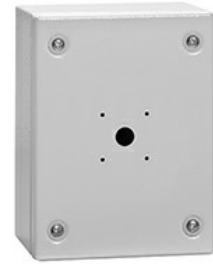
Empty metal enclosures GAZM