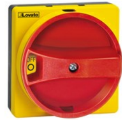
Handles for switch disconnecter GAX6