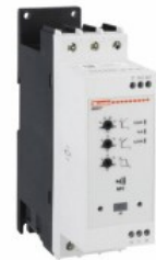
Soft starter advanced ADXNP Asynchronous three phase