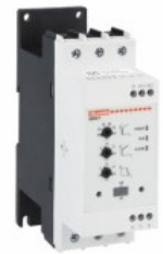
Soft starter advanced ADXNP Asynchronous three phase