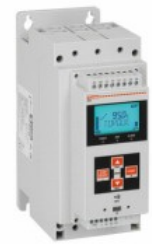
Soft Starter ADXL Asynchronous three phase

Product designation Product type designation Motor type