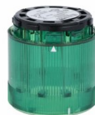
Coloane iluminate Ø70 mm 8TL7FL - Module ușoare