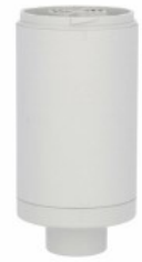
Signal tower Ø70mm/2.75" LTN70