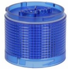
Signal tower Ø70mm/2.75" LTN70