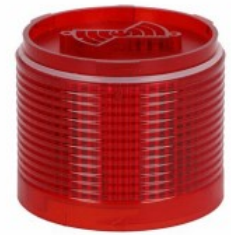
Signal tower Ø70mm/2.75" LTN70