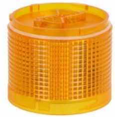
Signal tower Ø70mm/2.75" LTN70