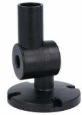
Signal tower Ø70mm/2.75" LTN70