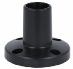
Signal tower Ø70mm/2.75" LTN70