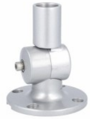
Signal tower Ø70mm/2.75" LTN70