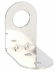
Signal tower Ø70mm/2.75" LTN70