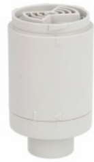
Signal tower Ø50mm/1.97" LTN50