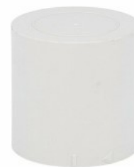
Signal tower Ø50mm/1.97" LTN50