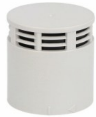
Signal tower Ø50mm/1.97" LTN50