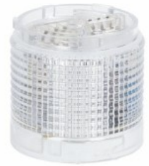
Signal tower Ø50mm/1.97" LTN50