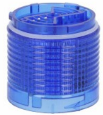
Signal tower Ø50mm/1.97" LTN50