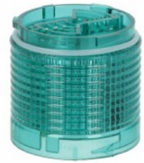
Signal tower Ø50mm/1.97" LTN50