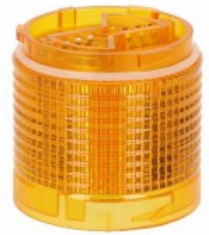
Signal tower Ø50mm/1.97" LTN50