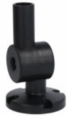
Signal tower Ø50mm/1.97" LTN50