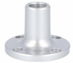
Signal tower Ø50mm/1.97" LTN50