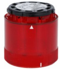
Signal tower Ø70mm/2.75" 8TL7GL - Light modules