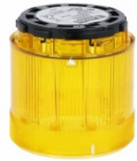
Signal tower Ø70mm/2.75" 8TL7FL - Light modules