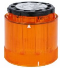
Signal tower Ø70mm/2.75" 8TL7FL - Light modules