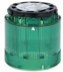
Signal tower Ø70mm/2.75" 8TL7EL - Light modules