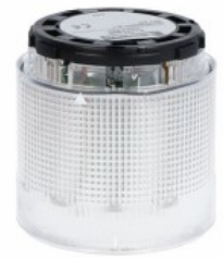
Signal tower Ø70mm/2.75" 8TL7