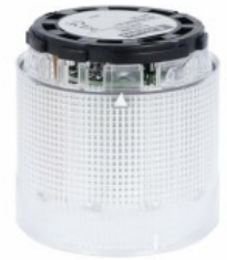
Signal tower Ø70mm/2.75" 8TL7