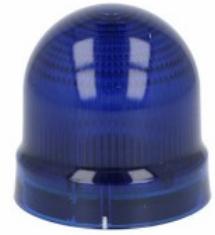
Signal beacons Ø62mm/2.44" 8LB6S