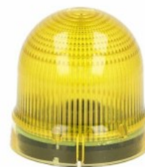
Signal beacons Ø62mm/2.44" 8LB6GL