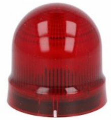
Signal beacons Ø62mm/2.44" 8LB6GL