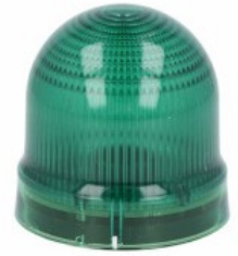
Signal beacons Ø62mm/2.44" 8LB6GL