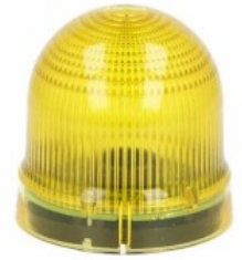
Signal beacons Ø62mm/2.44" 8LB6EL