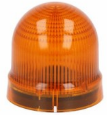
Signal beacons Ø62mm/2.44" 8LB6EL