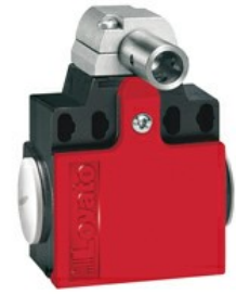
Hinge operating KNP