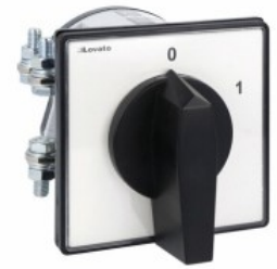
Rotary cam switches GN200