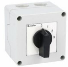
Rotary cam switches 7GN12