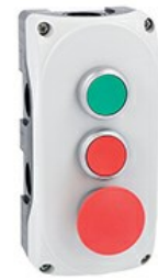
Grey control station LPZP3A8 complete with green flush pushbutton LPCB103 1NO, red flush pushbutton LPCB104 and mushroom pushbutton spring return LPCB6144 LPZP3B8912